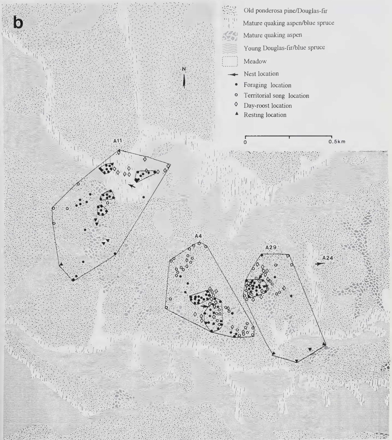
FIG. 1. Continued.

We examined the owls' choices of habitat at the second-order of selection (establishment of home range) by comparing the proportional area of overstory types within home range boundaries to the proportional area of types available within the study area. For this comparison, we established 95% confidence intervals on the mean proportions of each overstory type within the seven home ranges. Our investigation of the owls' third-order habitat selection focused on habitats used for foraging. We determined choice of overstory